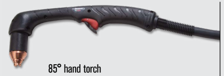
85° hand torch

Duramax® Hyamp™ standard torch styles (for more torch options, see www.hypertherm.com )