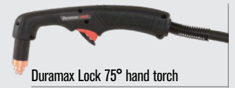
Duramax Lock 75° hand torch

(for more torch options, see www.hypertherm.com )